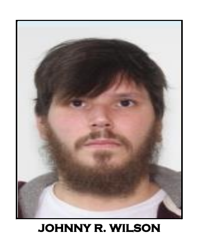
AGE: 33 HT: 6'01" WT: 180 DRIVING UNDER SUSPENSION BRUNSWICK POLICE